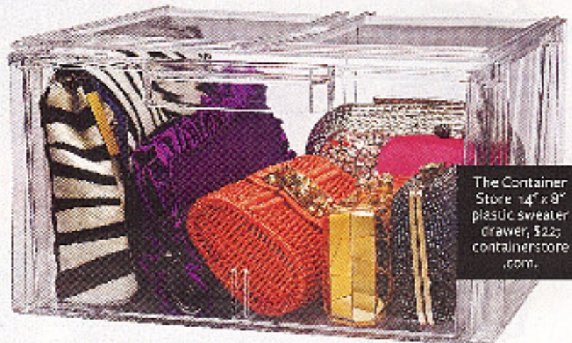
The Container Store 14" x 8" plastic sweater drawer, $22; containerstore.com

A Divide your bags into three categories: current rotation, special occasions or end-of-season. If there's room, snagger pretty knobs or hooks on the back of your closet door for go-to handbags, says storage expert Sara Greenberg. "Approach it the same way you would if you were hanging multiple pieces of art. Start with the largest handbag and put it around it," she says. Put special-occasion clutches in a transparent container or an accessible closet shelf. Move out-of-season handbags to a high shelf, or relocate them to the hall closet. When not in rotation, purses should be stuffed with acid-free tissue paper (8 1/2 sheets, at the Container Store) to maintain their shape and kept in a felt bag.