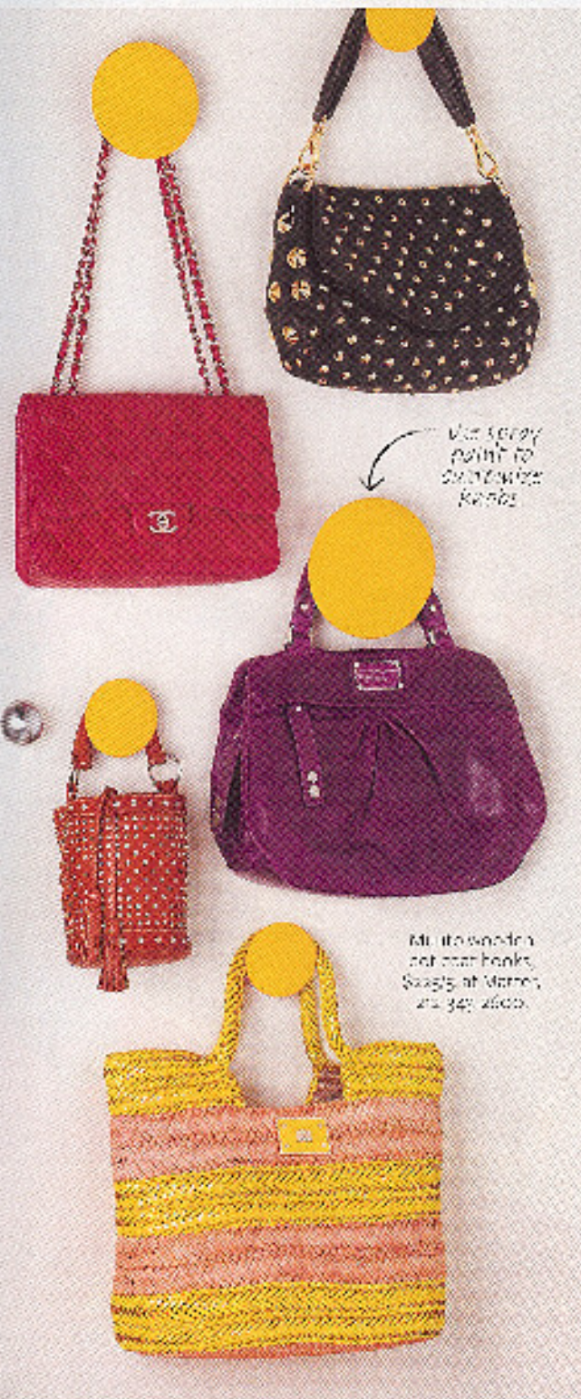
Use spray paint to disguise knobs

We help you make the most out of your space with expert advice on stashing your stuff